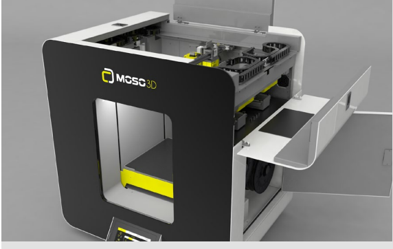
Easy access for maintenance

Toolchanging means truly being able to print in multiple materials, even if they have different requirements, because each material has its own extruder.